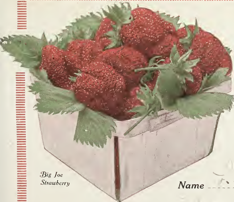
Big Joe Strawberry